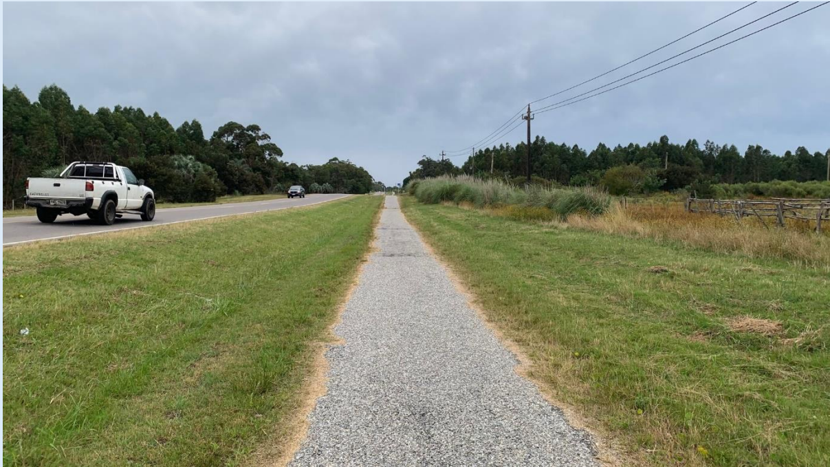
Bike lane on Route 10 during the first 20km of the stage