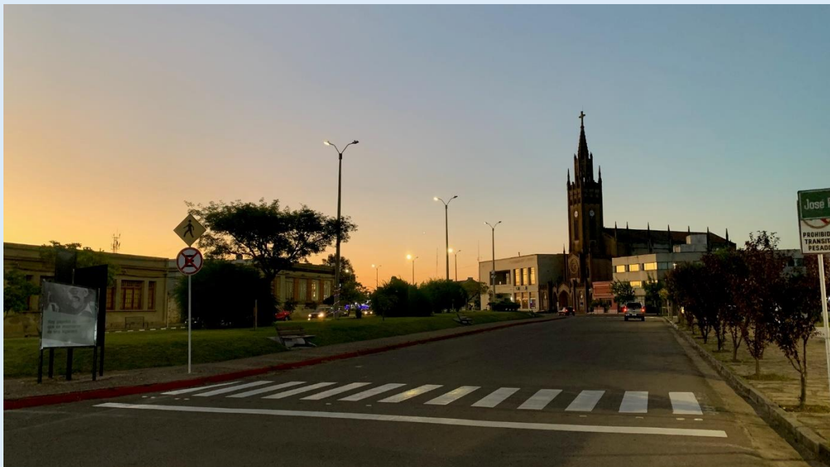
Santa Isabel Church in Paso de los Toros