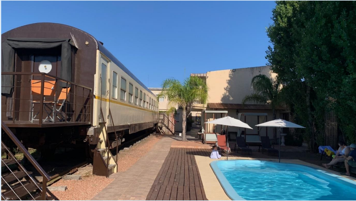
Hotel FK – Museum of the Tonic Water Paso de Los Toros