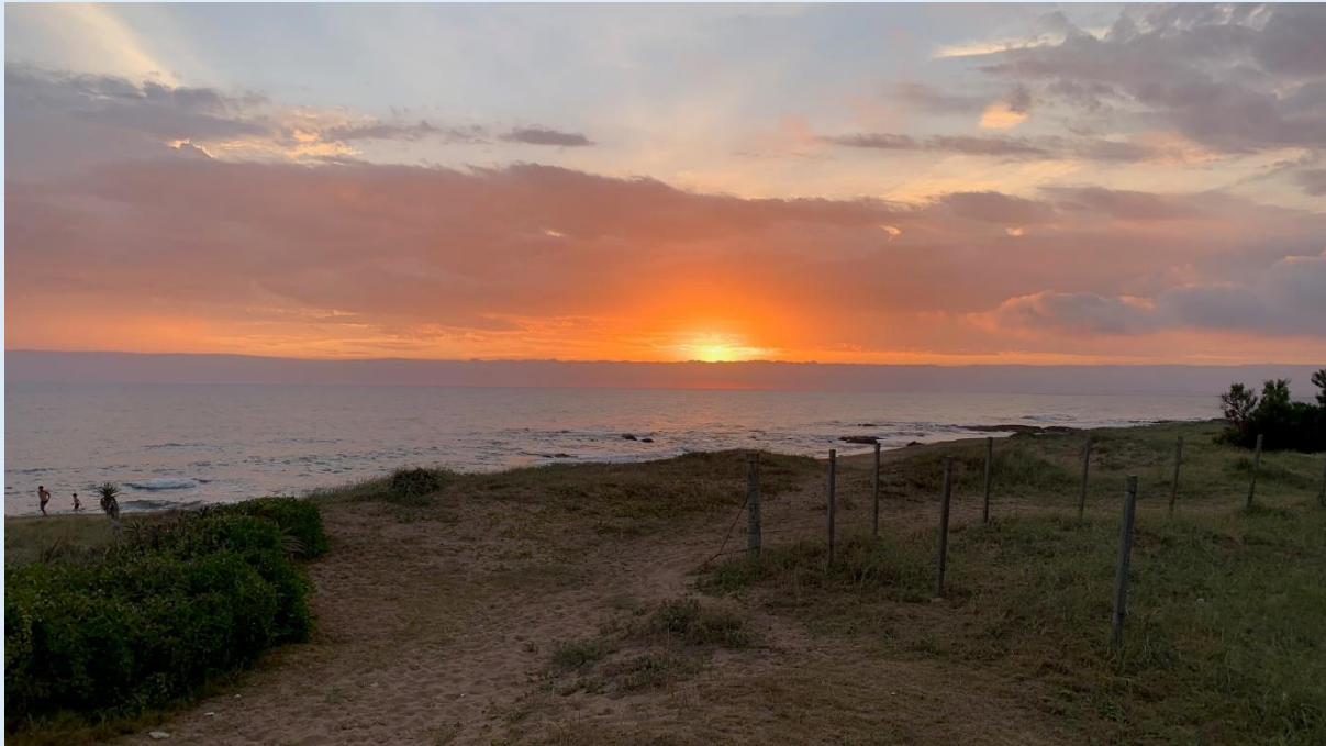
Sunset in La Paloma.