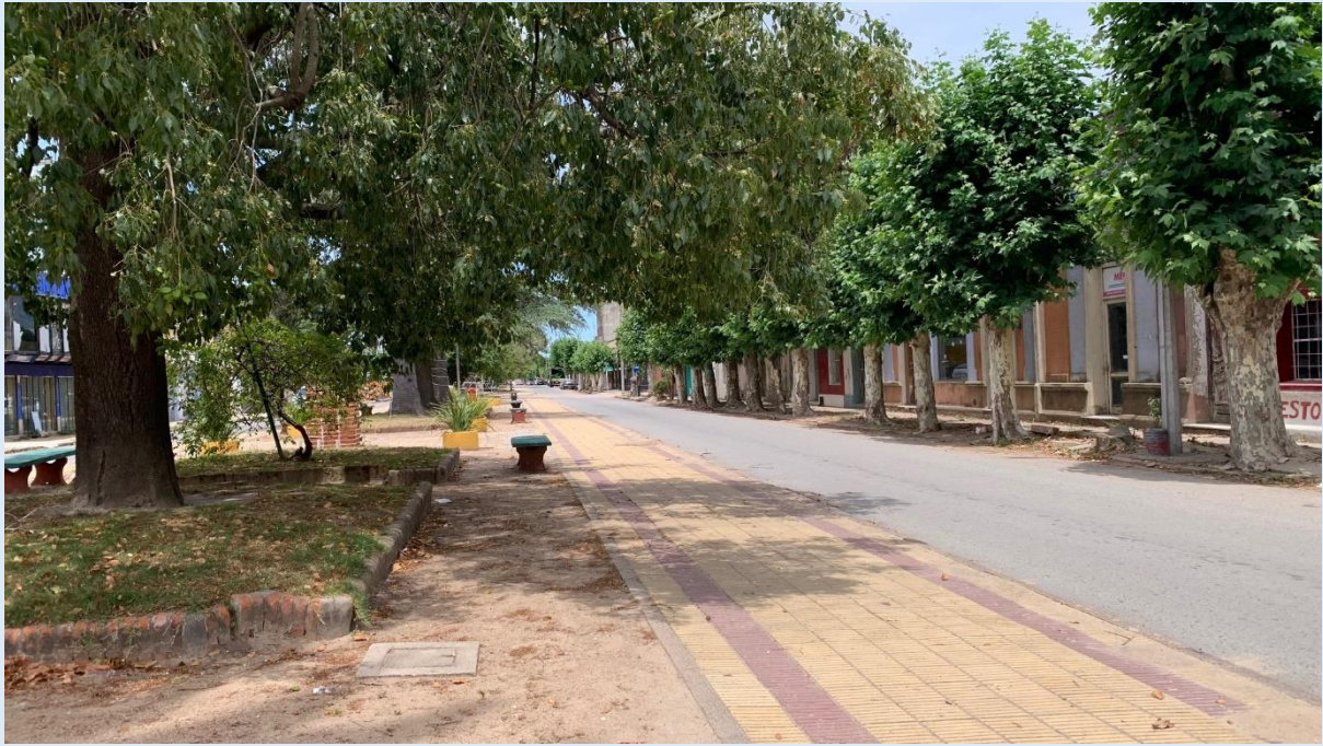
Streets of San Ramón