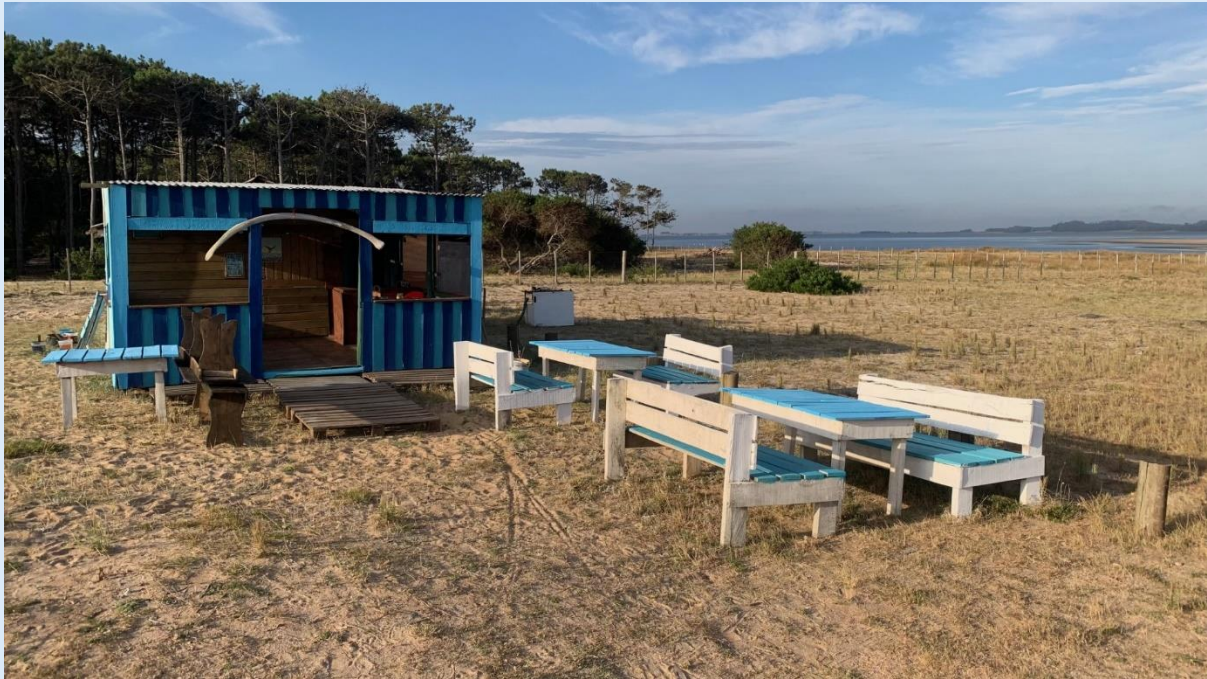
Bar Lobato, on the shore of Laguna Rocha, where you can have a soft drink and take the raft.