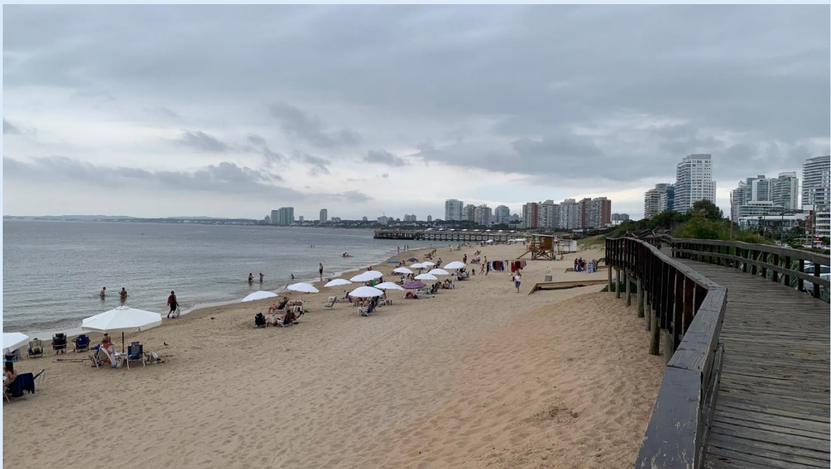
Punta del Este beaches.