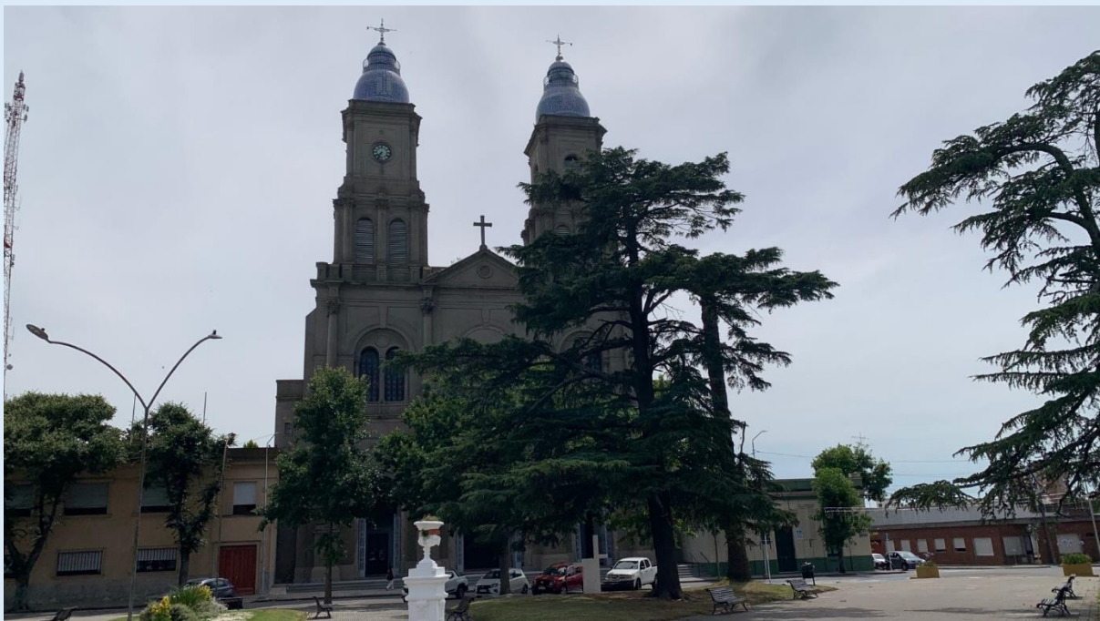
Florida Cathedral in Plaza de la Asamblea.