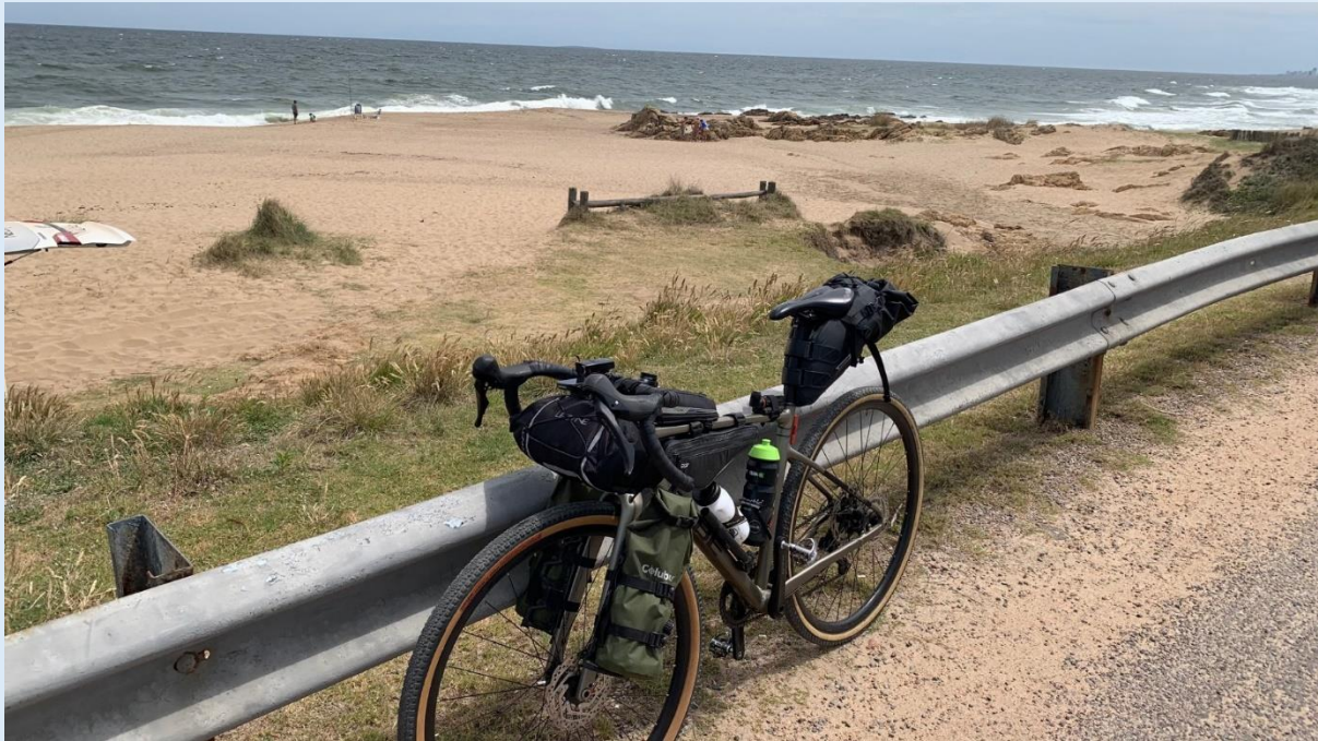
Route 10 parallel to the sea.