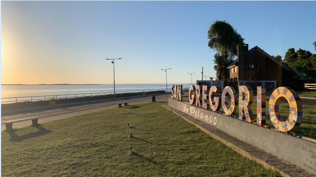
Beautiful views and sunsets in San Gregorio Polanco on the banks of the Rio Negro.