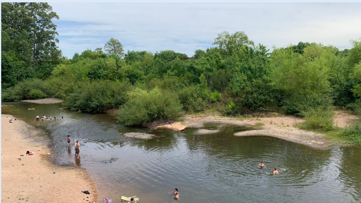
Bathers in the town of San Ramón

This route follows Route 12, passing through the towns of San Ramón and Tala. You can shorten the route by taking a well-maintained track called Rio Viejo before reaching San Ramón.