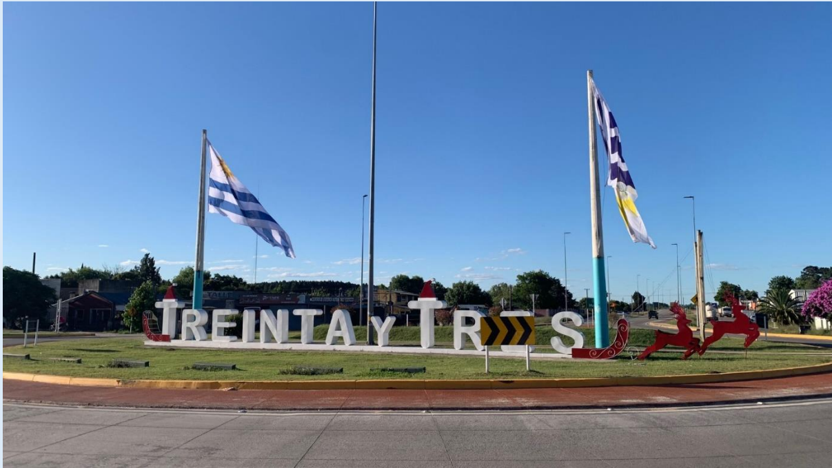
City of Treinta y Tres where the stage finish