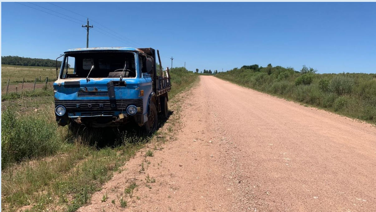
It is highly recommended to be well-supplied with food and drink along Route 14.