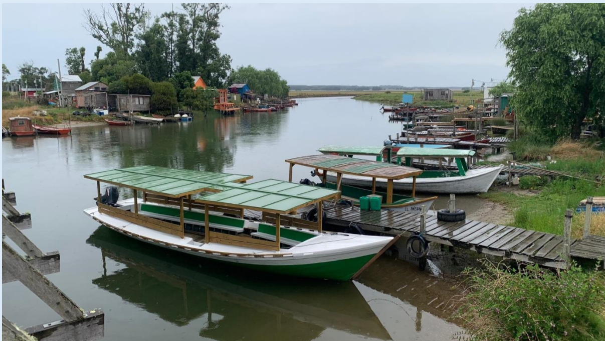
River at Puente Valizas