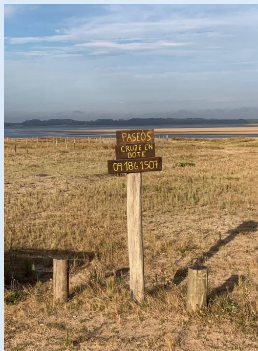
Telephone number to hire the raft if necessary.