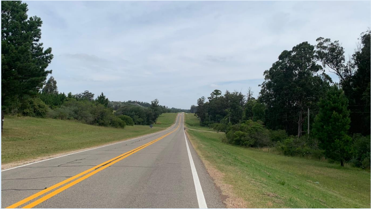
Arriving at Punta Ballena