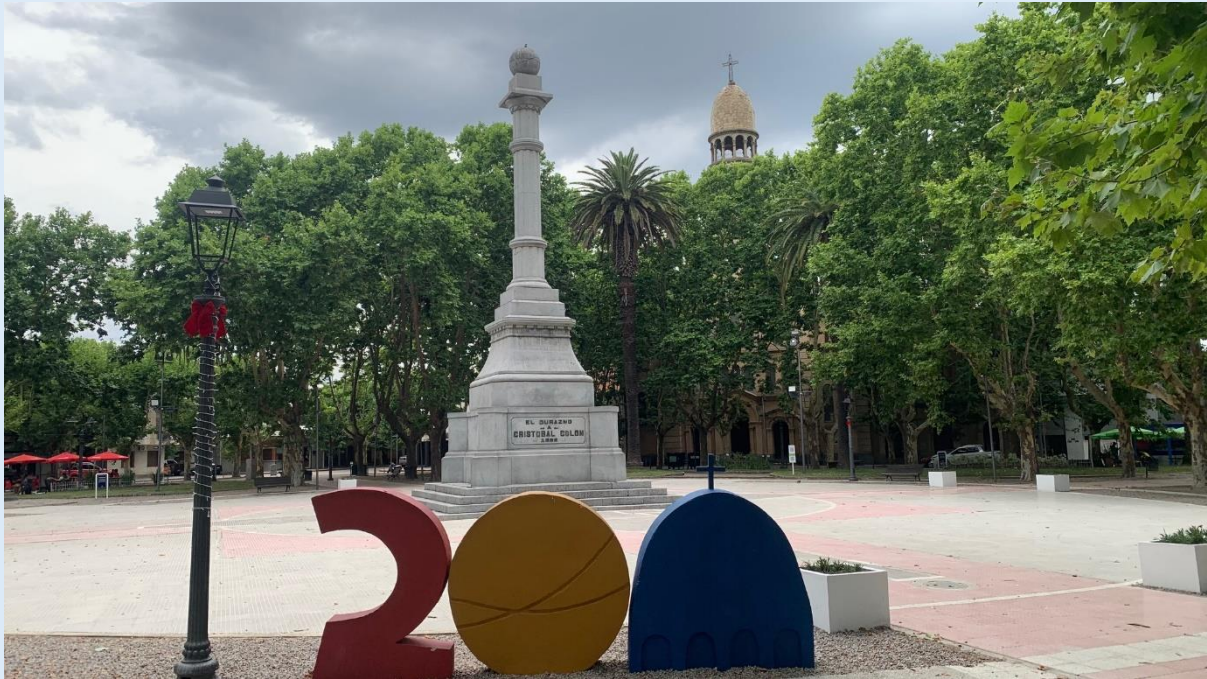
Tribute to Cristobal Colón in Independence Square in Durazno.