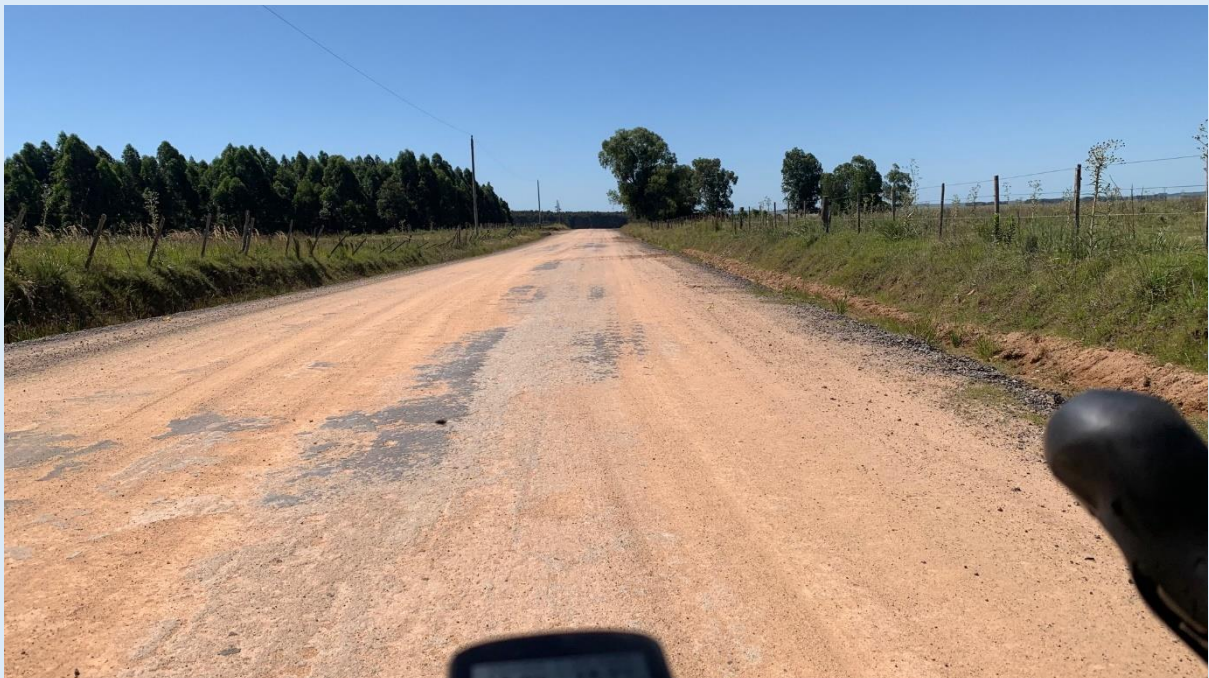
Gravel road in perfect condition in San José de las Cañas. Alternative detour after passing Capilla de Ferruco to avoid the Cerrezuelo road (route 6) for a while.

We started the day again on Route 19, a 45km stretch of gravel road, quite deteriorated this time due to roadworks. Later, we followed a mix of paved and unpaved sections to San Gregorio Polanco. A spectacular place with river beaches perfect for a refreshing swim.