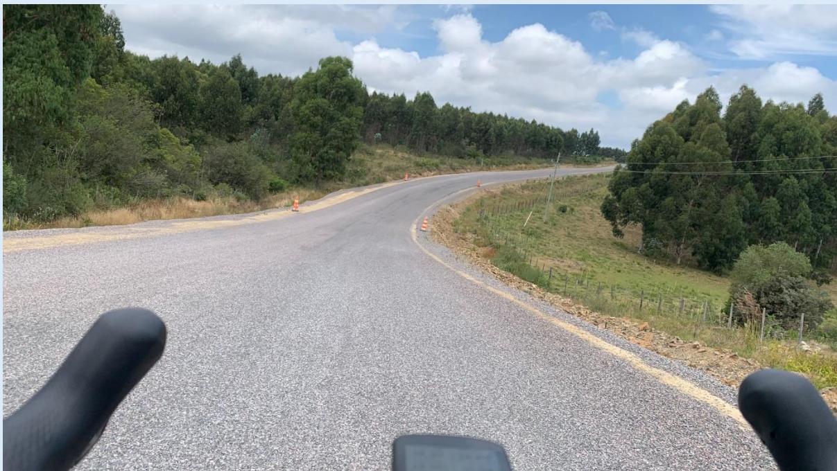
Mountain roads in the Minas region. Route 12.

The stage with the most elevation gain. Unusual climbs for this country with gradients of up to 10%. A road route winding through mountains and verdant landscapes. I recommend hydrating in Pueblo Edén. Arrival in Punta del Este via the highway. Punta del Este boasts spectacular bays and beaches.