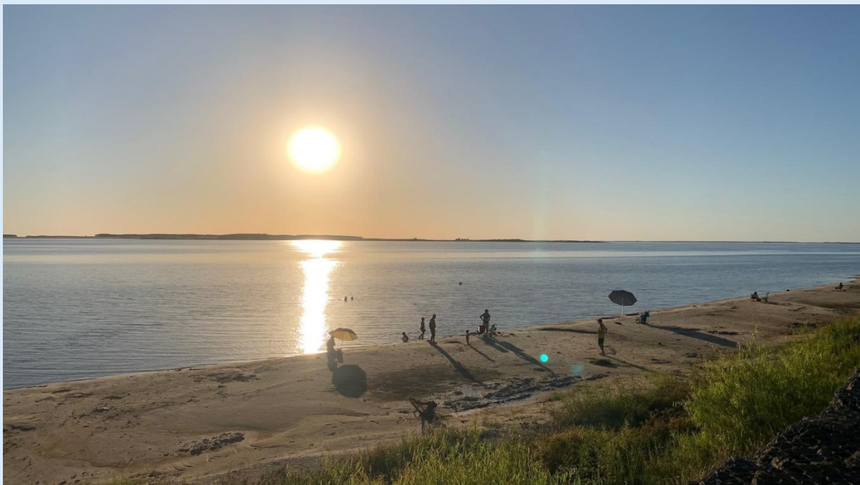
Bathers on the banks of the Rio Negro enjoying the sunset.