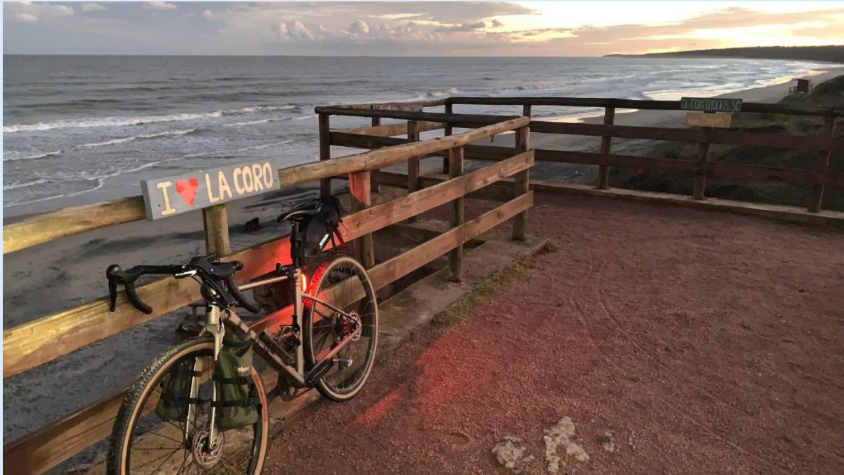
Sunset in La Coronilla