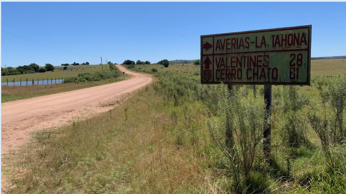
Route 19. Tough and lonely.

We started on Route 19 to Valentines. 76km of gravel road with no towns. Route 19 is similar to Route 14. Don't forget to bring plenty of supplies and patience. From Valentines to Cerro Chato, the road is in good condition. A leg-breaking stage. I recommend staying at Posada del Míster. Exceptional service and maximum comfort..