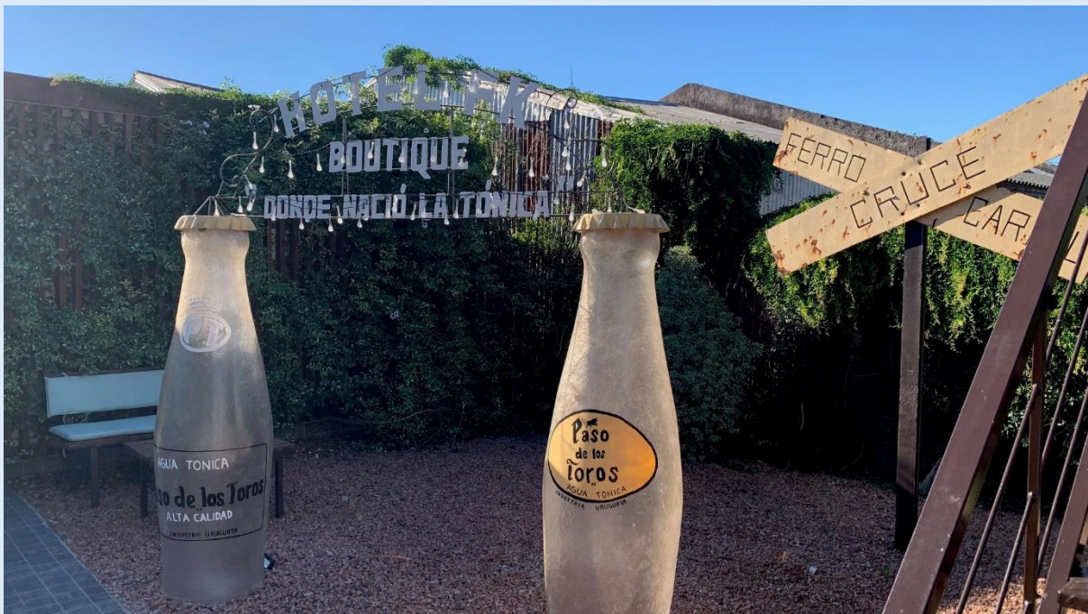
Hotel FK. Where the Tonic Water was born. Guided tour highly recommended