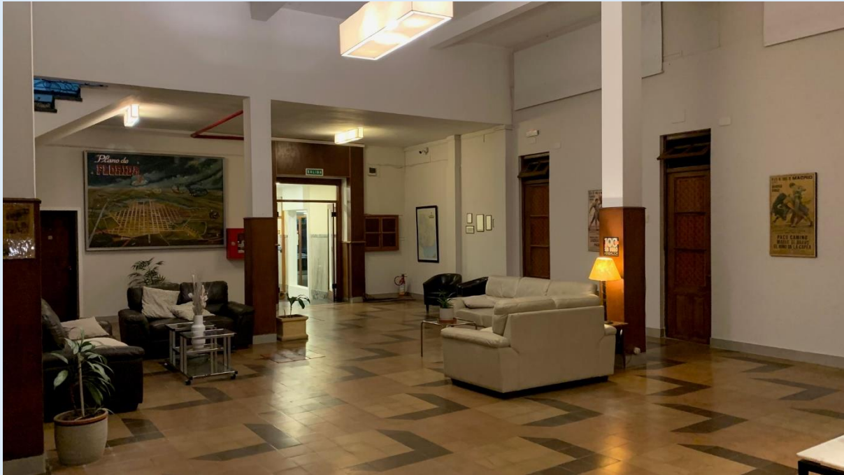
Entrance hall and reception area of the Hotel Español in Florida. A journey back in time 100 years.