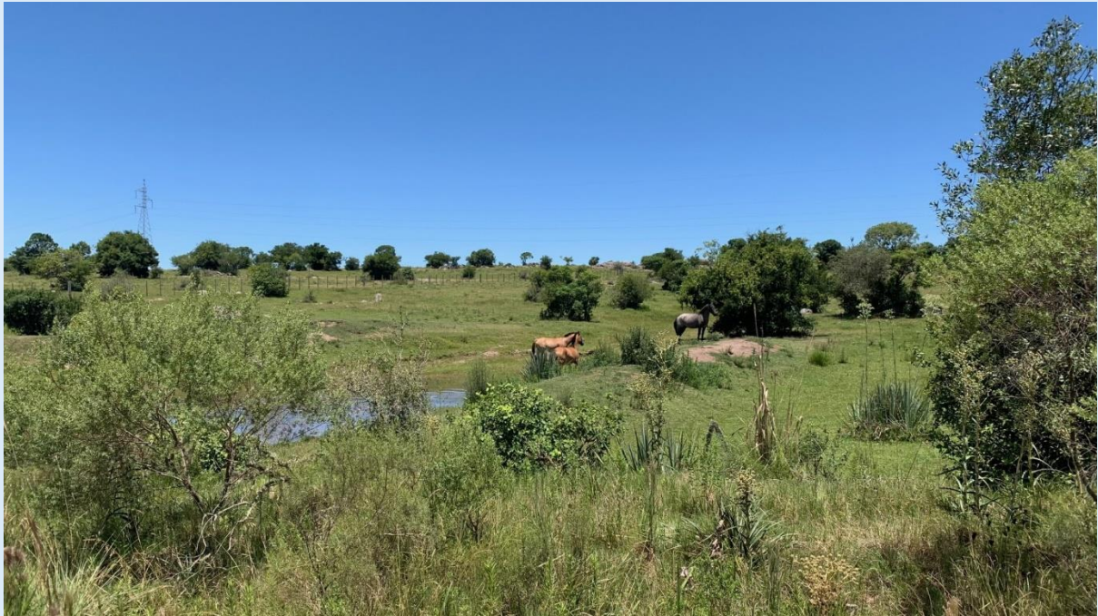
Route 19. Spectacular landscapes with cattle everywhere.