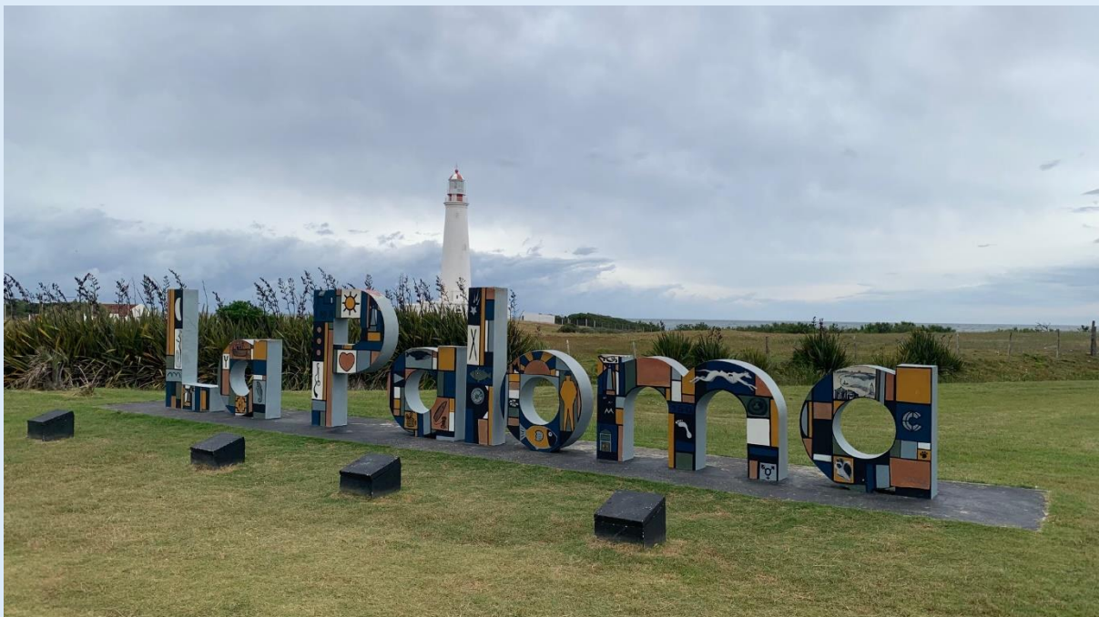
Lighthouse in the city of La Paloma

Route 10 and Route 9. Almost entirely highway with little traffic, except for the final stretch on Route 9 where traffic increases as it approaches the border with Brazil. Flat stage.