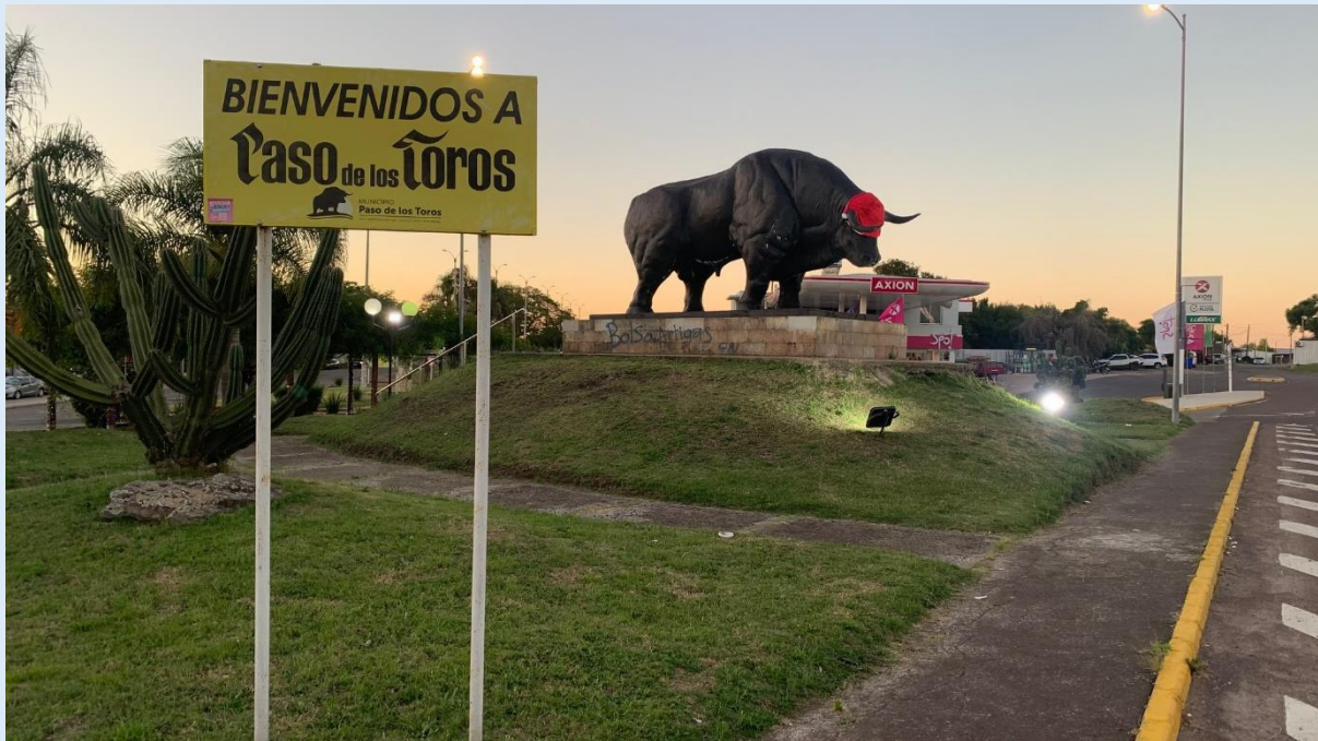
Monument to the Bull in Paso de los Toros

The entire route follows well-maintained but challenging roads along routes 43 and 5. I recommend stocking up on food and drinks in the village of Achar. If you can afford it, I highly recommend staying at the Hotel Boutique FK, located in the former Paso de los Toros Tonic Water Factory. They offer a guided tour of the old factory, which is highly recommended. You can also enjoy a refreshing dip in their swimming pool.