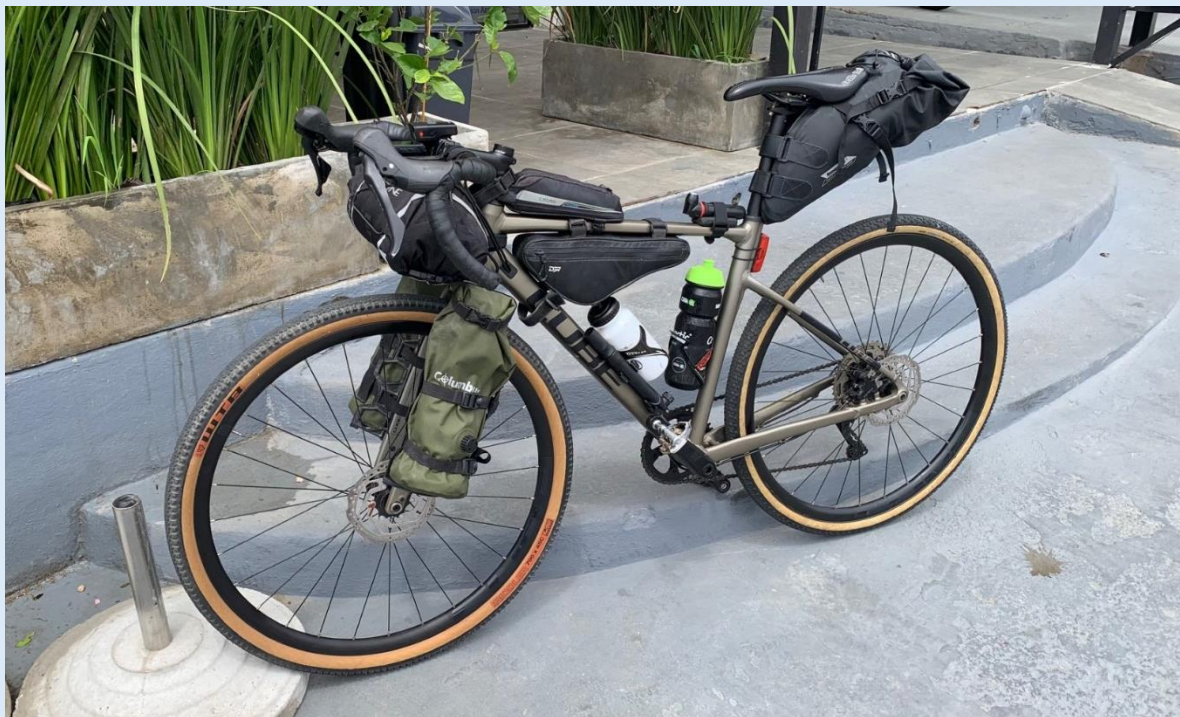
The bike perfectly adjusted and loaded.