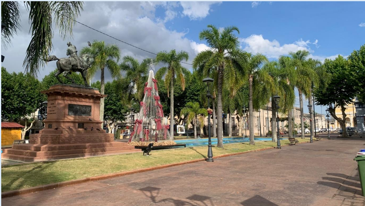
Plaza de la Libertad in Minas