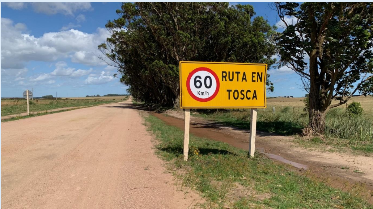
Route 14. "Sterratto" or ruta en tosca.

The gravel adventure begins. Route 14, the first 80km are all gravel with no towns until Lascano. From Lascano to Treinta y Tres, the road is in good condition. A demanding and leg-breaking stage.