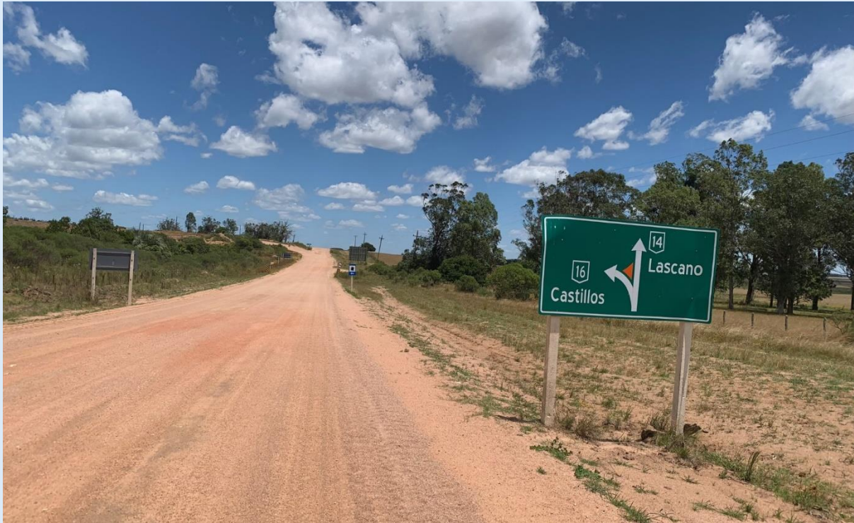
Until Lascano 80km of sterrato.