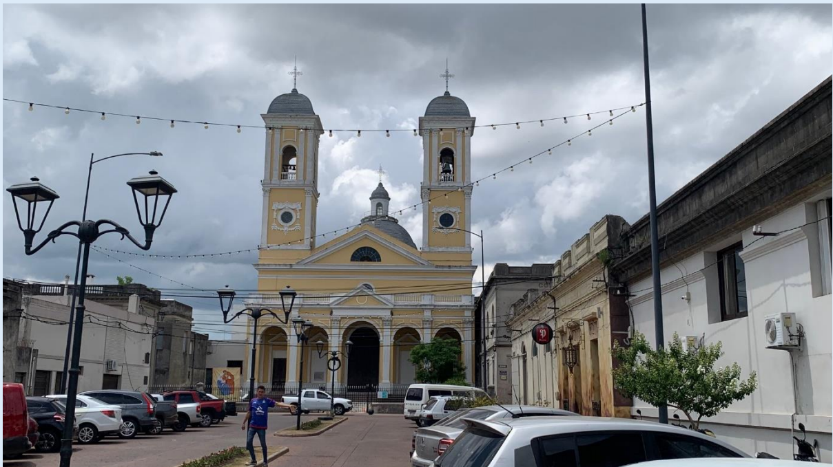
Cathedral of Minas